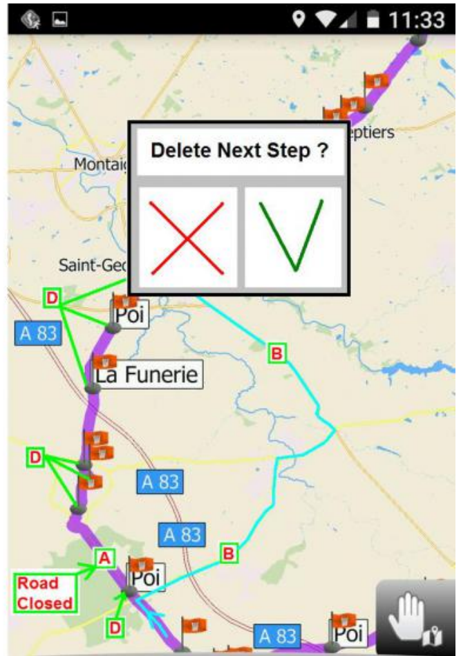
TomTom Maps For Mapfactor Navigator Mega